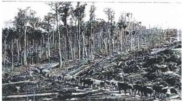
No. 9. THE KAURI BUSH, WHANGAREI, AUCKLAND N. Z.