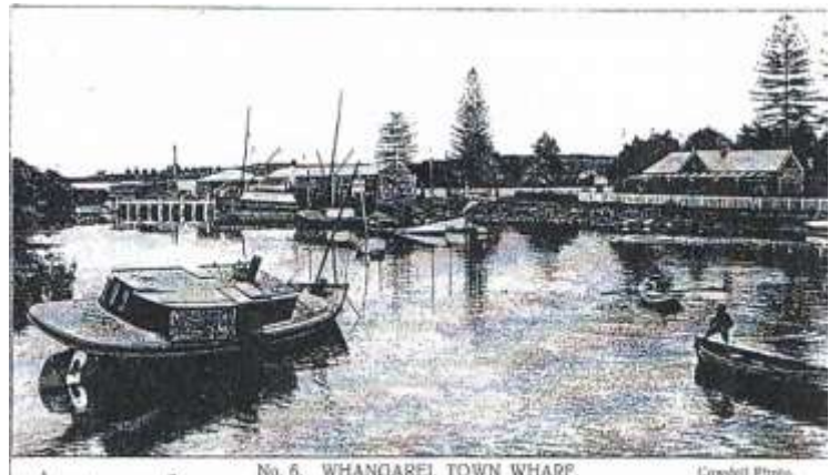
No. 6. WHANGAREI, TOWN WHARF.