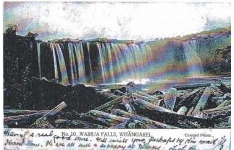
No. 10. WAIRUA FALLS, WHANGAREI.