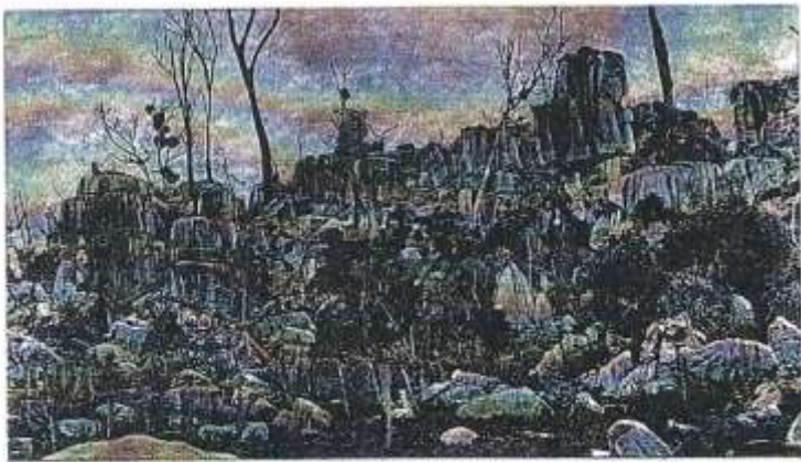
No. 5. "LIME ROCKS", WARO.